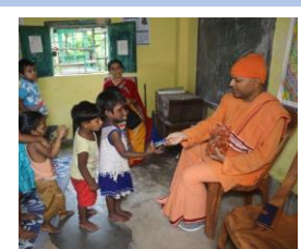
Snack distribution for children at RKVM