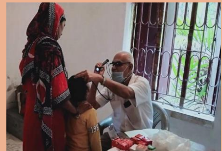
Medical camp for SCI supported children at Mass Welfare Society: Little Flower School, Dhamua.