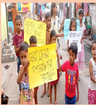
Mantra: Students participate in Community projects

SCI-Supported schools regularly engaged students and their families in programs that focus on Child Rights & Protection, Gender Discrimination, Health & Hygiene, Environment, and social issues.