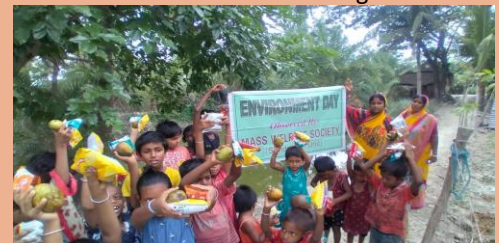
Students participated in environment day (Mass Welfare Society) Sundarban Unit