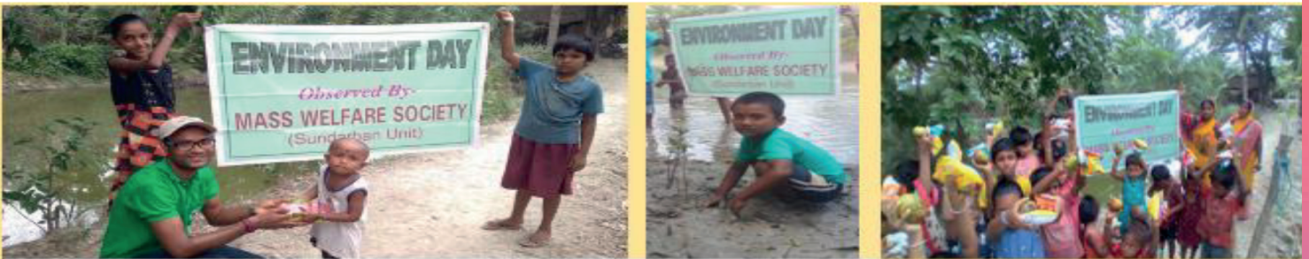
Environment Day Activities (Mass Welfare Society) Sundarban Unit

Email: Streetchildreninternational@gmail.com