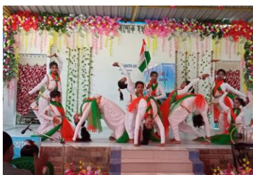
Students at Antoday Orphanage