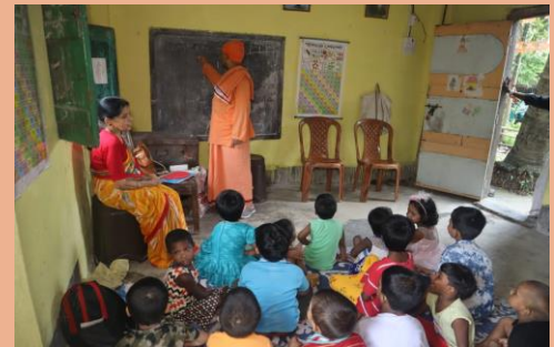
Children at RKVM attending class