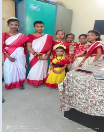
Students participated in cultural program (Mass Welfare Society)