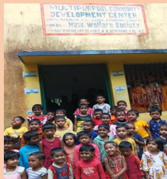
SCI supported children at the Multipurpose Community Development Center-Dhamua